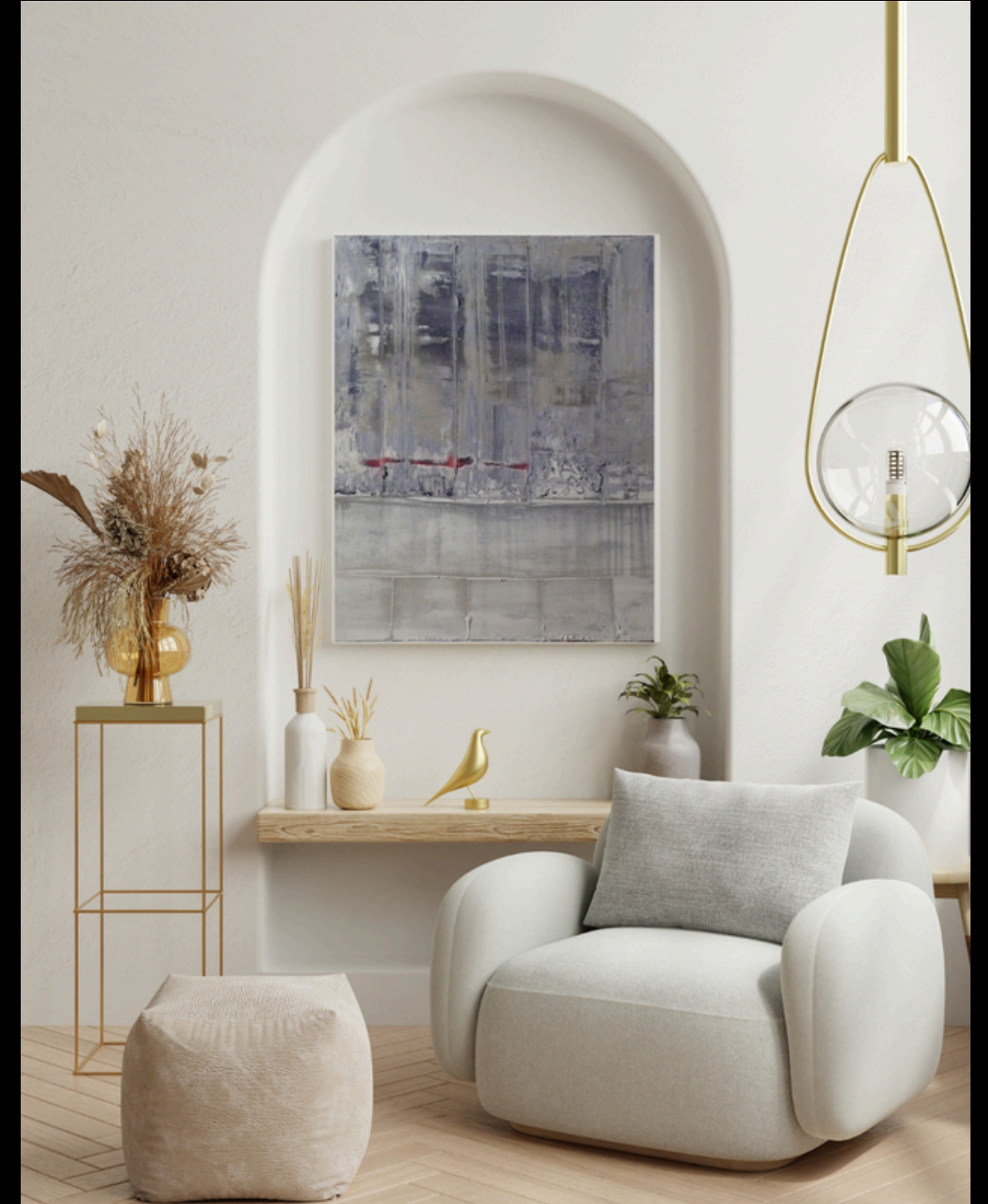
Oia (Santorini). 73 x 60 x 3 cm. Acrylic and mixed technique. 2005.

Resident for two years in the United Arab Emirates. Contract with Acento Gallery in Abu Dhabi, which represented my work. Presently resident in Barcelona (Spain).