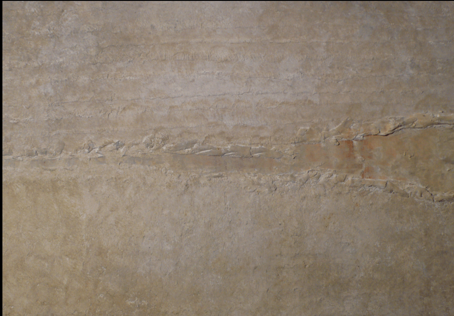
Wei. 60 x 73 x 2 cm. Acrylic and mixed technique. 2008.