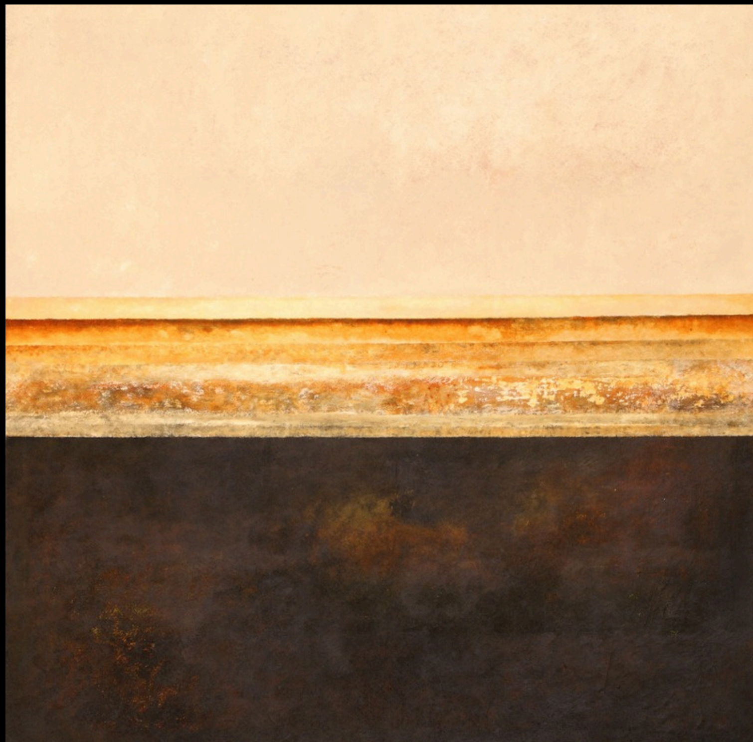
Sunset on the Countryside , 100 x 100 x 2 cm. Acrylic and mixed technique. 2023.