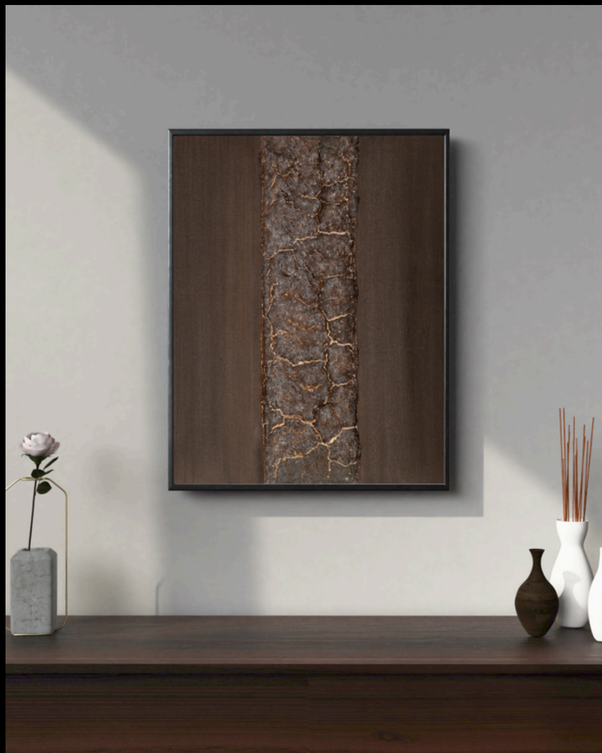
Beyond density . 60 x 73 x 3 cm. Acrylic and mixed technique. 2009.