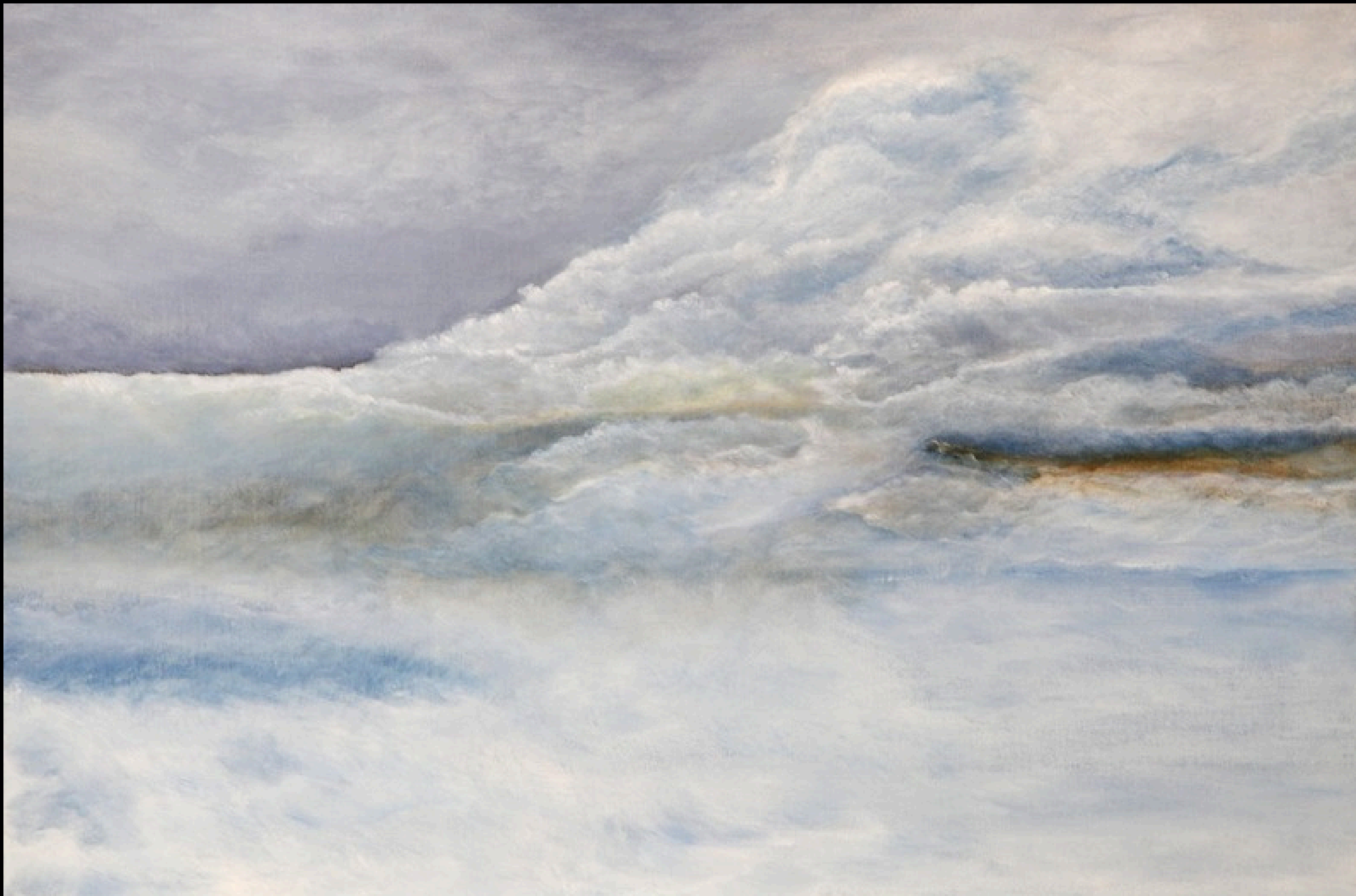
Sky Landscape. 100 x 73 x 2 cm. Acrylic. 2022.