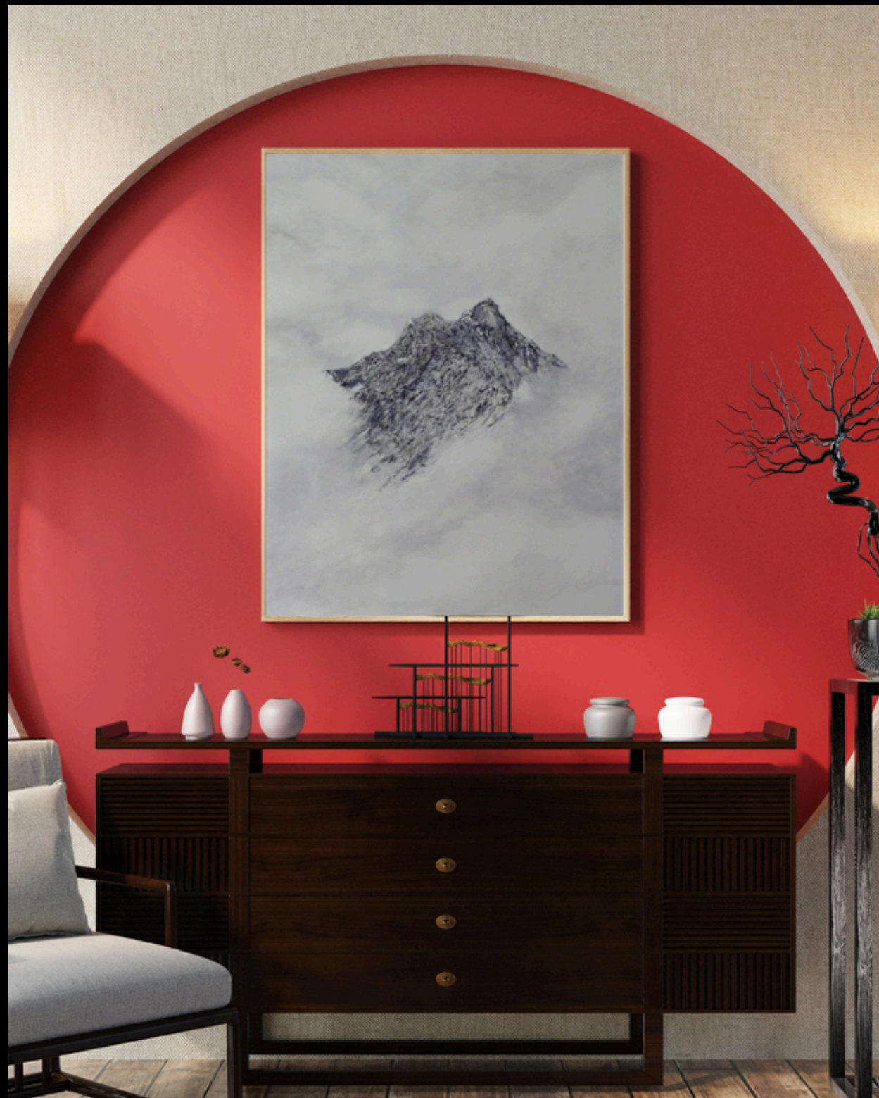
Mountains among clouds. 145 x 115 x 2 cm. Acrylic. 2008.