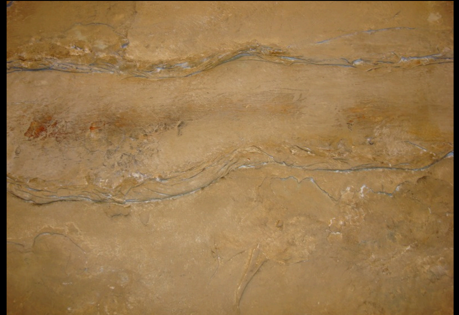
You. 60 x 73 x 2 cm. Acrylic and mixed technique 2008.