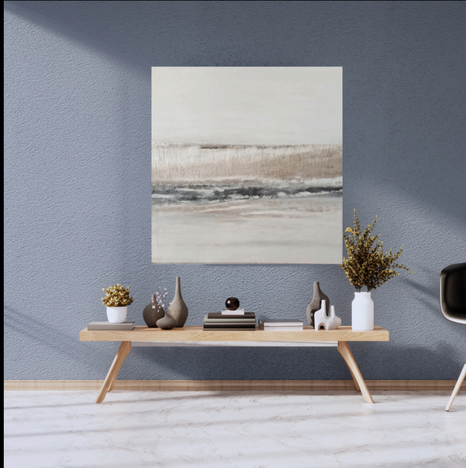
White Landscape. 100 x 100 x 3 cm. Acrylic. 2025.