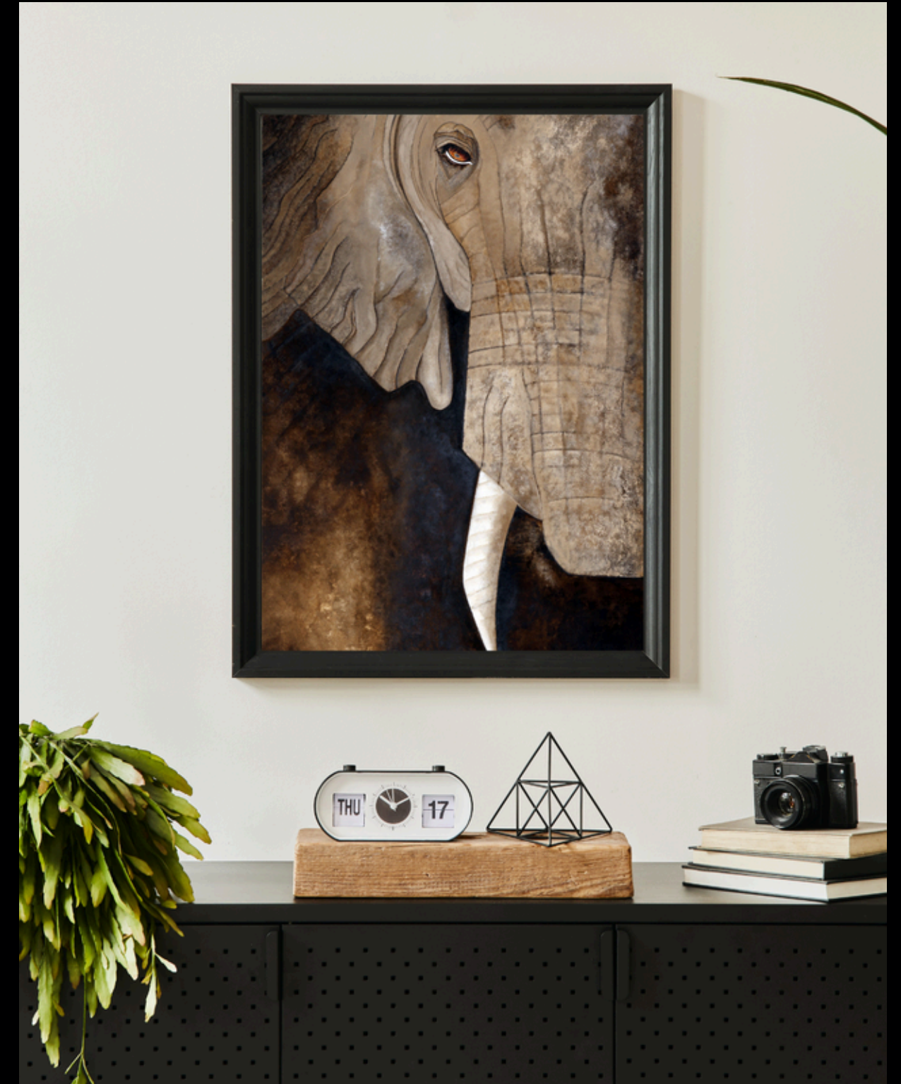
Elephant. 100 x 160 x 2 cm. Acrylic and mixed technique. 2024.

I pursue what it is mysterious in nature, in its beauty: the gaze of an animal, the landscape that opens up when a flight gains altitude, the magnificence of some mountains in the mist... any image that remains firmly etched in my retina.