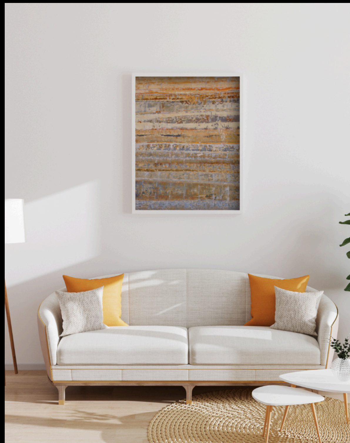
Sundown (Santorini) . 60 x 45 x 2 cm. Acrylic and mixed technique 2007.