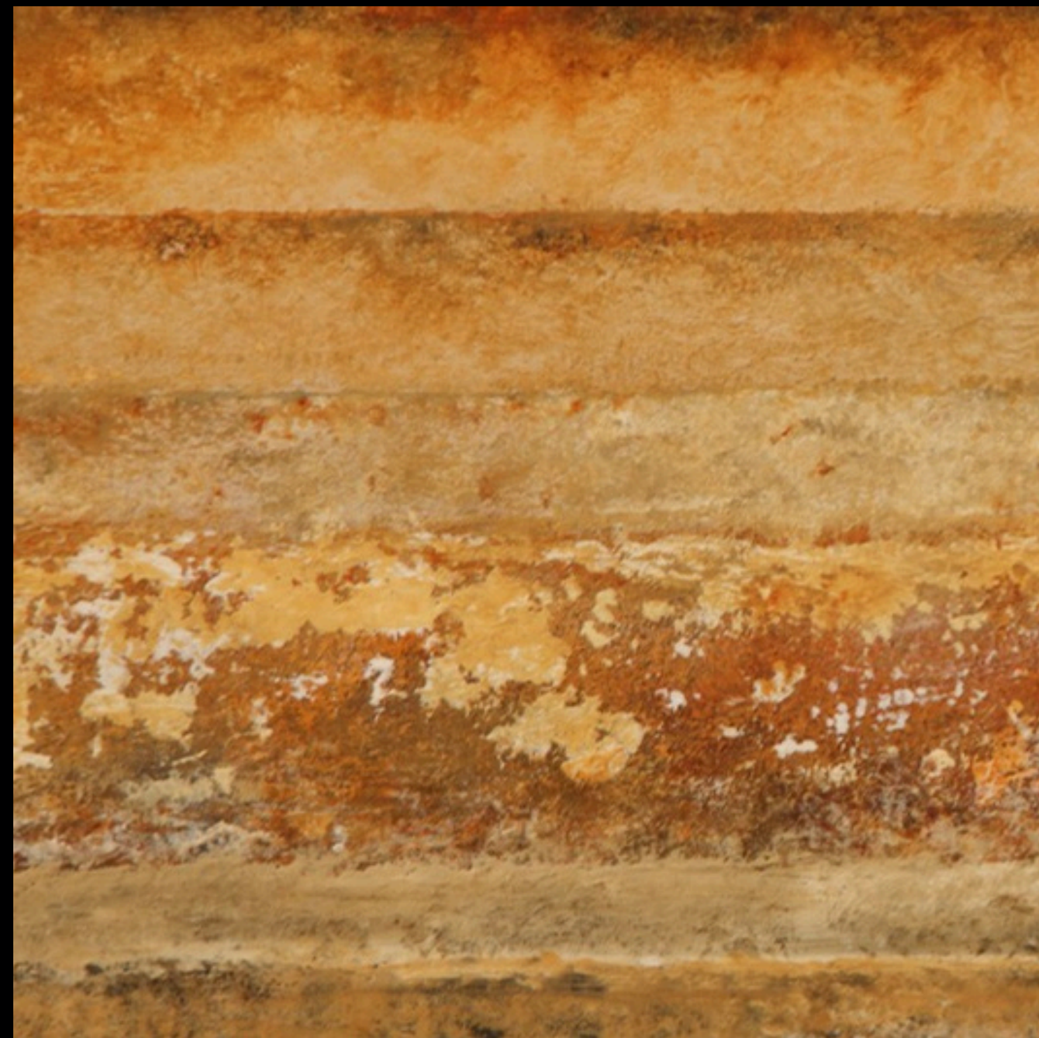
Detail of the painting,