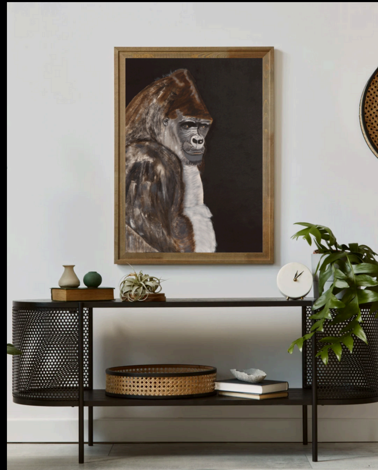
Silverback. 100 x 80 x 1 cm. Acrylic. 2020.