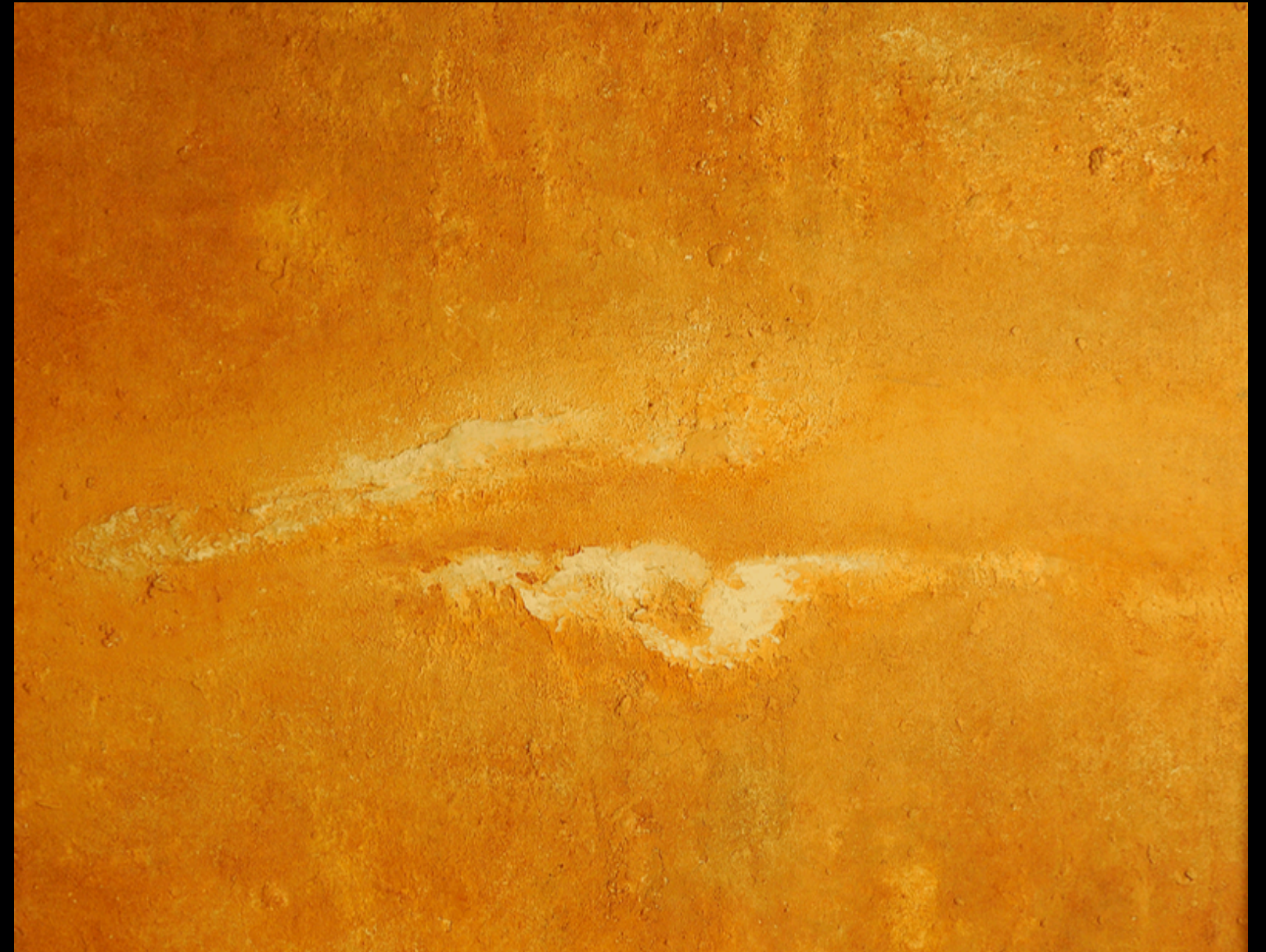
On the desert. 61 x 51 x 1 cm. Acrylic and mixed technique. 2009.

My pictorial universe is fundamentally shaped by textures: through them, I seek to capture interior landscapes, images that have remained engraved in my memory and the mystery of what is not apprehensible.