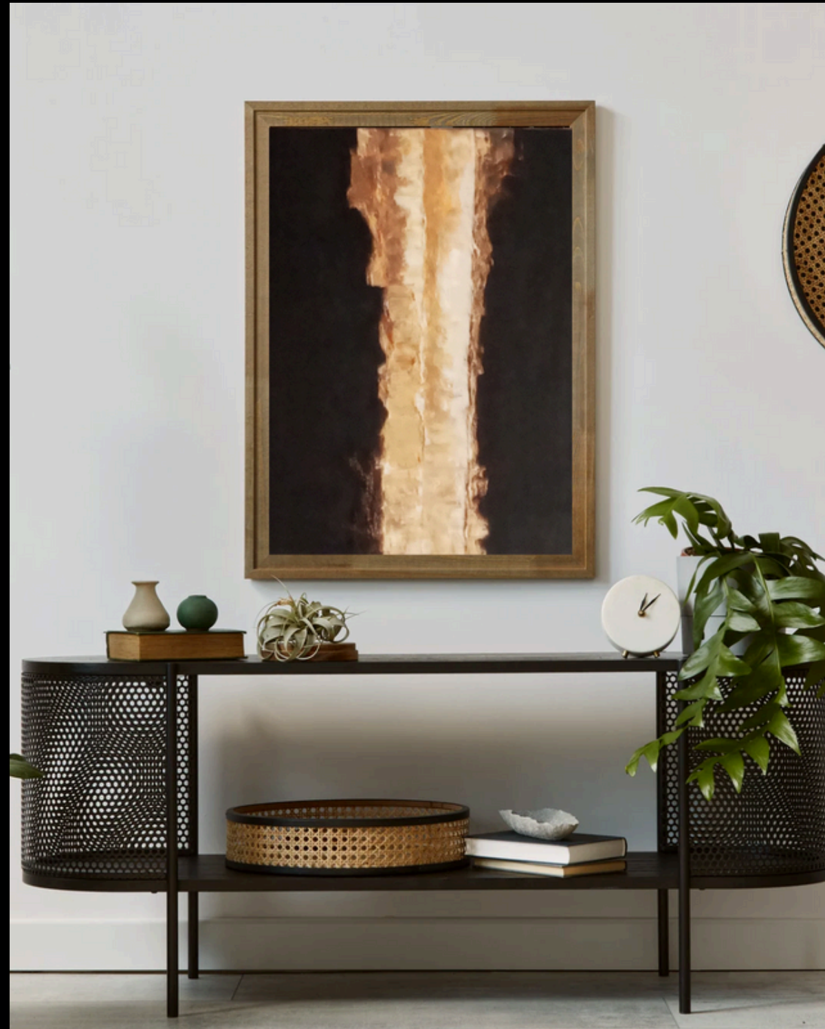
Soil. 63 x 71 x 3 cm. Acrylic and mixed technique. 2025.

Once I finish a painting, my next great satisfaction is that the people who look at it feel the same experience of silence, calm, serenity, joy and harmony.